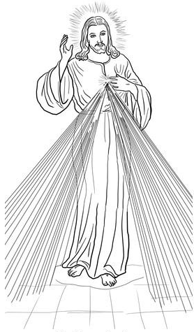
JESU UFAM TOBIE

Sr Faustina Kowalska, a Polish nun, was God's instrument to proclaim Divine mercy toward every human being. Sr Faustina was inspired by a vision in which Jesus told her that a painting should be made of his image with the invocation "Jesus, I trust in you." She commissioned the painting in 1935. Cardinal Karol Wojtyla, then Archbishop of Krakow (later St. Pope John Paul II), began Sr Faustina's process of beatification. At her