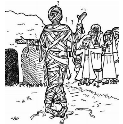
“Jesus raises Lazarus.” John 11:1 – 44

Lazarus was dying, and his sisters, Martha and Mary, sent word to Jesus to come immediately to the village of Bethany where they lived. The disciples feared for Jesus' life as the town was near Jerusalem. Knowing his fate awaited him in the Holy City, Jesus declared that God's glory would be revealed so that all might believe. Jesus was delayed in coming, and upon his arrival, Martha told Jesus that he was too late; her brother had already died. Although Martha reproached Jesus for not coming sooner, she was confident that God would grant whatever he asked. Jesus told her that he had power over life and death and asked her if she believed that his words were true. Like Peter, Martha confessed her faith in Jesus as the “Messiah, the Son of God”. With a powerful command, he raised Lazarus to life, a symbol of Christ's own resurrection and our rising to new life with him. Ironically, it was this gift of life that would lead to Jesus' own death, which offered salvation to the whole world.